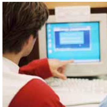
Online training programs