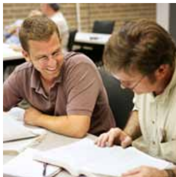
Customized onsite training programs