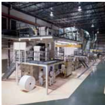
Training & workshops

Since 1915, TAPPI has been one of the best centralized resources for education and training in the pulp & paper, packaging and converting industries. Why not look to us to help provide your mill training programs through a variety of flexible training approaches.