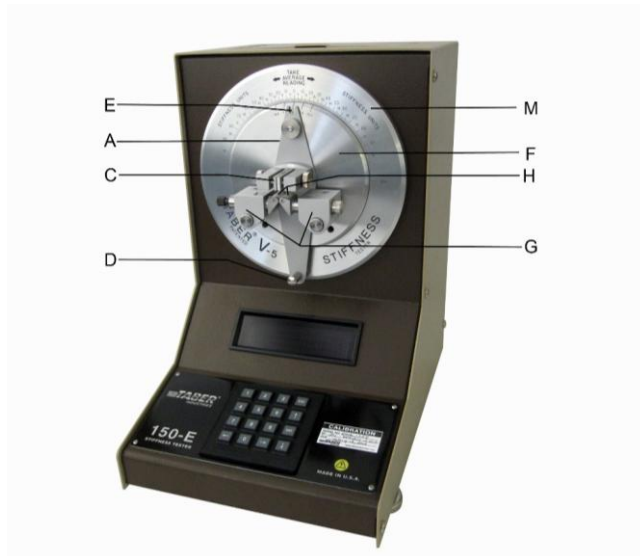
Fig. 1. Digital version of instrument

6.1.1.4 A 10-unit compensating weight (X) to be mounted on the stud (Y) near the top of the pendulum when the instrument is used as described in this test method.